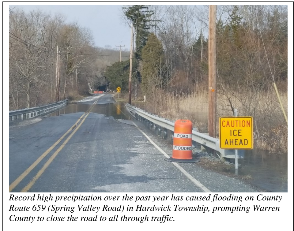
Record high precipitation over the past year has caused flooding on County Route 659 (Spring Valley Road) in Hardwick Township, prompting Warren County to close the road to all through traffic.

Motorists should use Millbrook Road (County Route 602) to Blairstown and Stillwater Road (County Route 521) as detours to avoid the flooded section of Spring Valley Road.