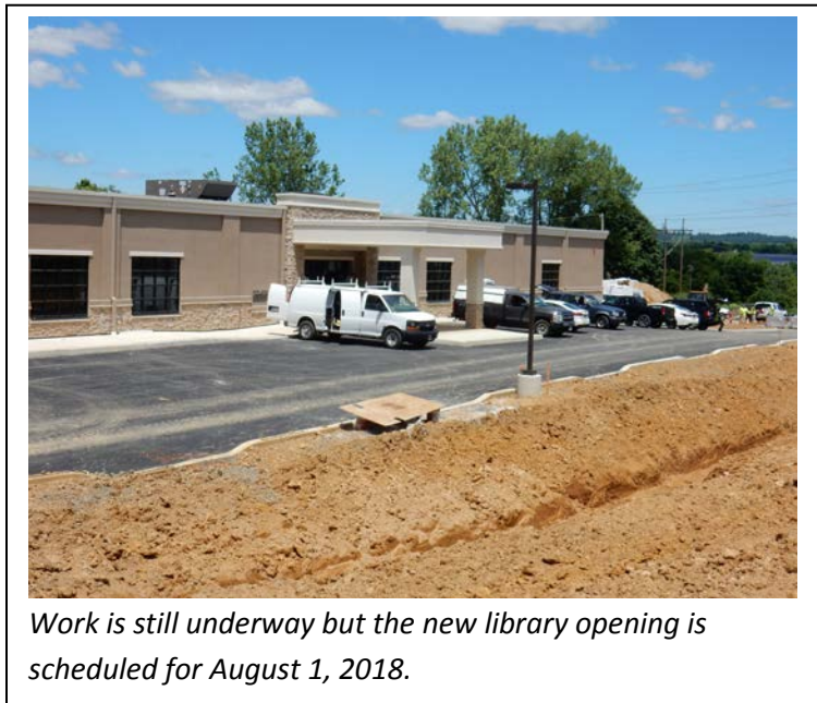
Work is still underway but the new library opening is scheduled for August 1, 2018.